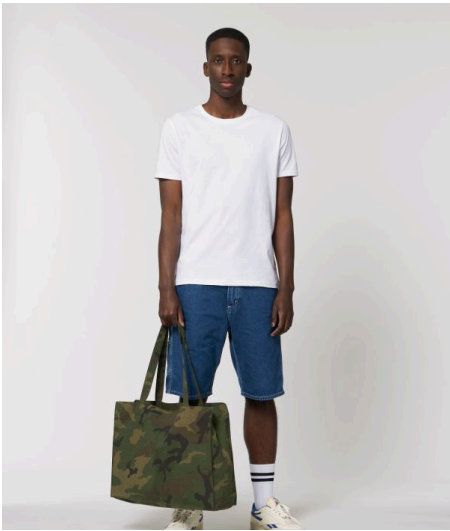
ALL OVER PRINT