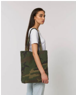
Tote Bag AOP

Shell : Canvas , 80% Cotton - Recycled , 20% Polyester - Recycled , 300 GSM