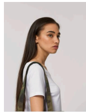
Tote Bag AOP