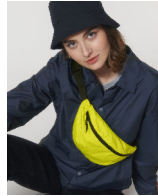
Lightweight Hip Bag