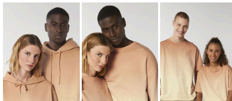
Slammer Dip Dye