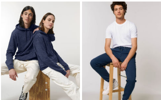
Cruiser Denim Stanley Stepper Denim

Shell : Terry Jogger Pants , 85% Organic ring-spun combed cotton , 15% Recycled polyester , Garment washed , Yarn Dyed , 300 GSM