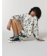
Stella Kicker Tie and Dye