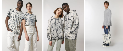
Creator Tie and Dye