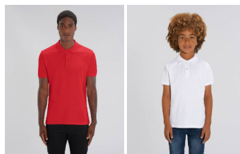
Stanley Dedicator Mini Sprinter