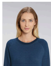
Stella Tripster Denim