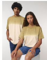
Fuser Aged Dip Dye

Shell : French Terry , 100% Cotton - Organic Ring Spun Combed , Garment washed , Garment dyed , 350 GSM