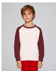
Mini Scouts Contrast