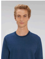
Stanley Stroller Denim