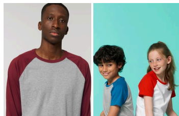
Catcher Long Sleeve Mini Catcher Short Sleeve