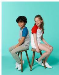
Mini Catcher Short Sleeve