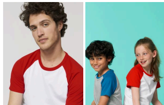
Catcher Short Sleeve Mini Catcher Short Sleeve