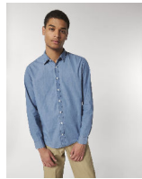
Stanley Innovates Denim

Shell : Woven denim , 100% Cotton - Organic Ring Spun Combed , Garment washed , Yarn Dyed , 170 GSM