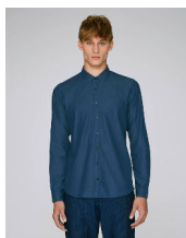
Stanley Innovates Denim